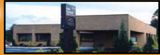
A Telecommunications Provider