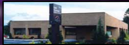
A Telecommunications Provider